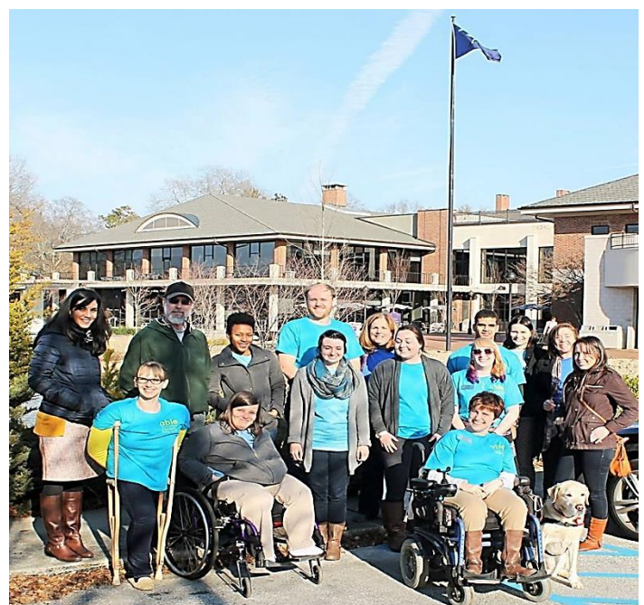
Able South Carolina staff break for a pose during the “Mapping Your Future” conference.