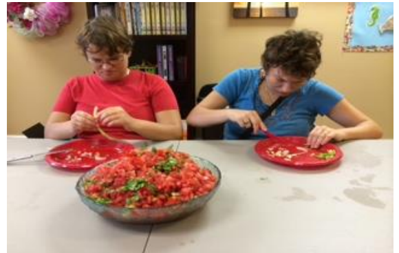
Participants dice vegetables from the farmers market.

Objective 3: Will support a minimum of one emerging issue that will result in an increase in people with Intellectual Disabilities/Developmental Disabilities being active participants in the communities of their choice.