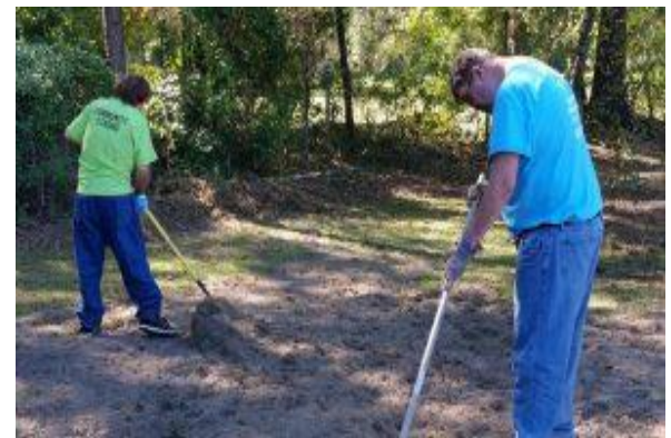
Participants prepare a garden for planting.